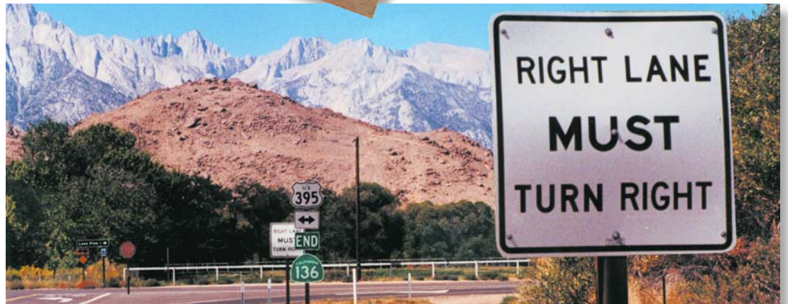
Below: Mt. Whitney meets urbanization.